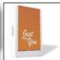
Pack of 8 Nos.