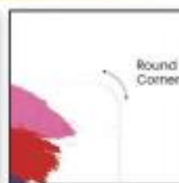
Large Curved Edge Cut