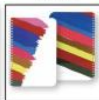
Front & Back