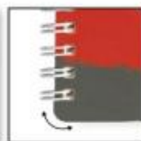
Curved Edge Cut