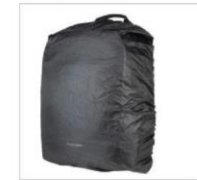
Built in rain cover