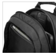
Padded inner compartment for laptop &