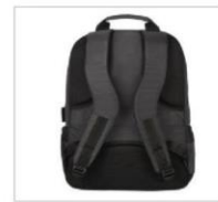
Padded shoulder straps