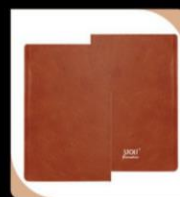
Front & Back