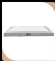
Individual Packaging With Transparent Top Cover For Logo & Name Visibility