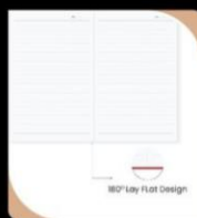
180° Lay Flat Design